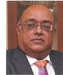
Natarajan & Swaminathan Chartered Accountants of Singapore 1 North Bridge Road #19-04/05 High Street Centre Singapore 179094

T (65) 6661 0100 E ns@nsca.pro www.nsca.pro